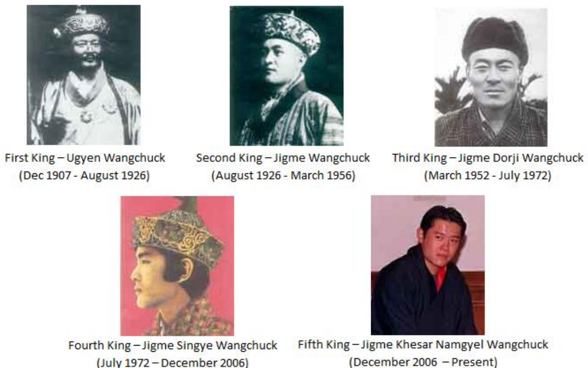
Figure 1: Monarch and Reign 13