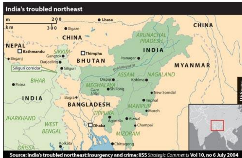
Map 1: India's troubled northeast

There are three territorial disputes between Bhutan and China 10 . Both China and Bhutan claim the 495 square kilometer area of Pasamlung and Jakarlung valleys as part of their respective countries in the central sector and 269 square kilometer area in the western sector 11 . The Pasamlung and the Jakarlun valleys are of interest to China because of its closeness to Tibet but China envy Doklam Plateau the most. India is deeply worried because of China's claim to these areas and India's Centre for Land Warfare Studies (CLAWS) describes the strategic value of the region: "The Doklam Plateau lies immediately east of Indian defenses in Sikkim. Chinese occupation of Doklam would turn the flank of Indian defenses completely. This piece of dominating ground not only has a commanding view of the Chumbi Valley but also overlooks the Silguri Corridor further to the east." 12